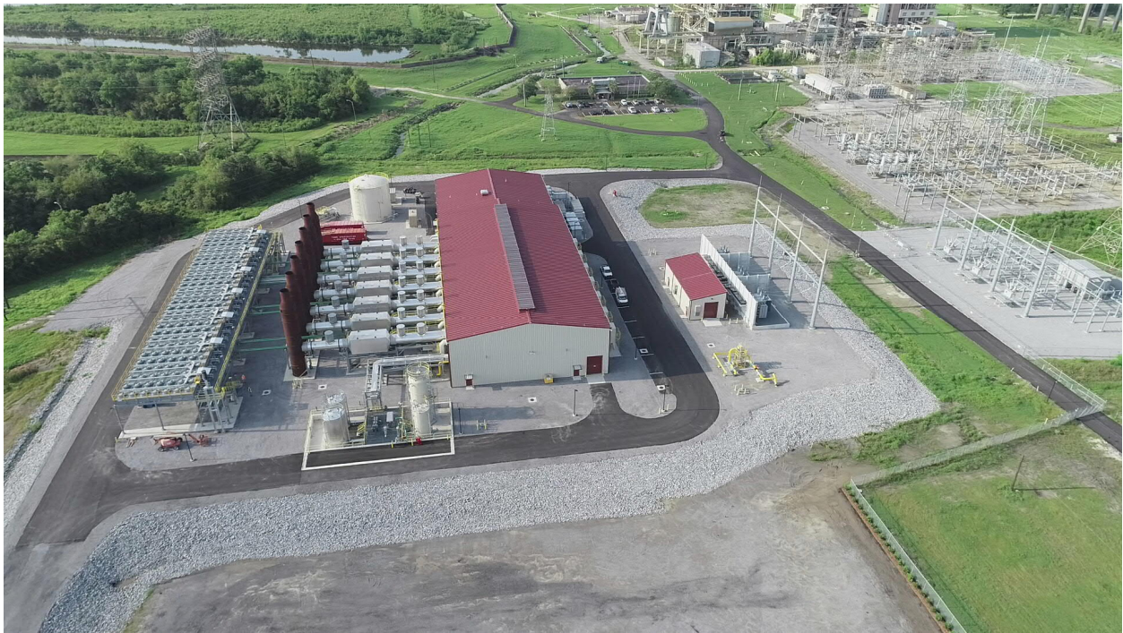
Drone photo of NOPS Site (August 2020)